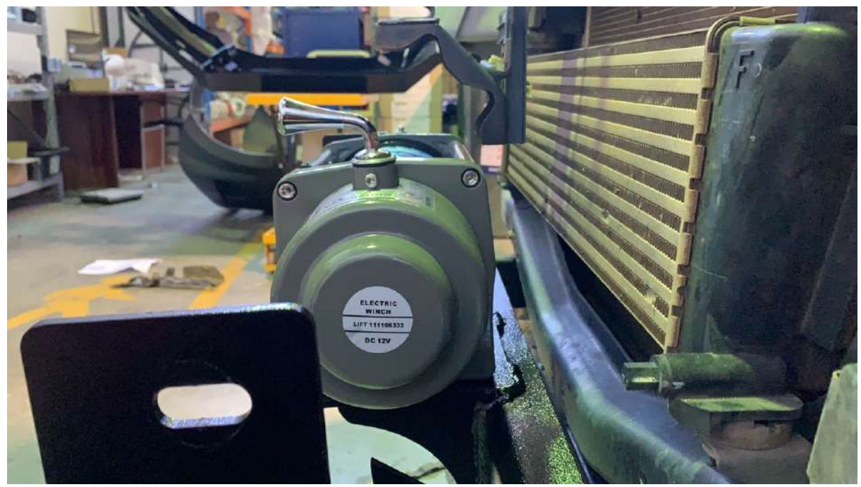
5) See above cut line and finished result.