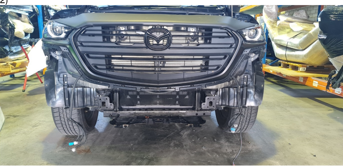
The bullbar comes with chassis reinforcement collars, install these before installing the main winch cradle. The collars go on finger tight.