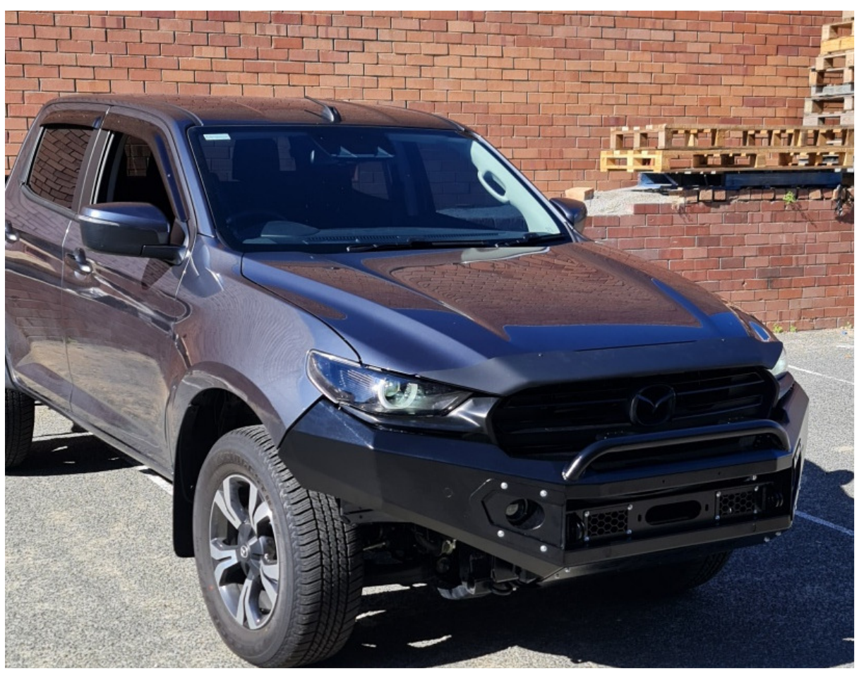
Install Number plate and done.